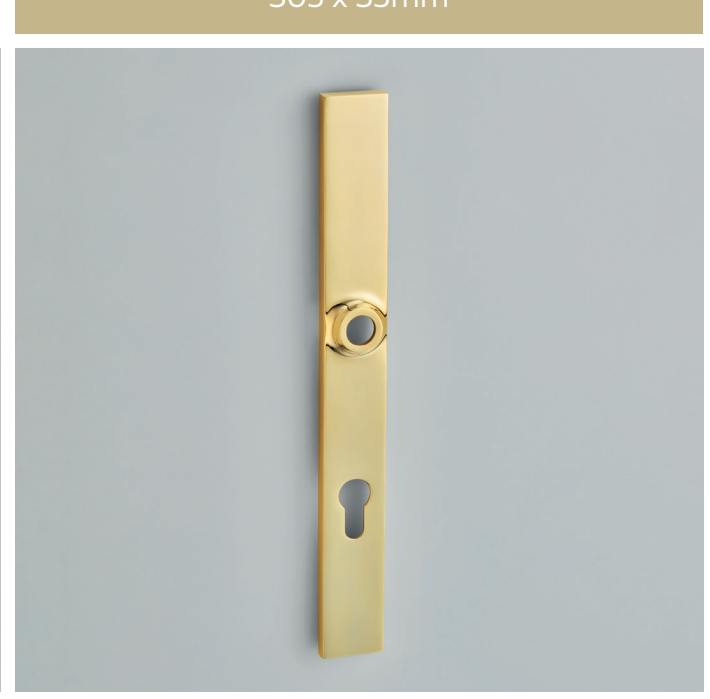
Unsprung or with Spring Cassette Bolt fix or Face fix Available in Latch and Euro Profile

Keyhole centres can be manufactured to customer requirements.