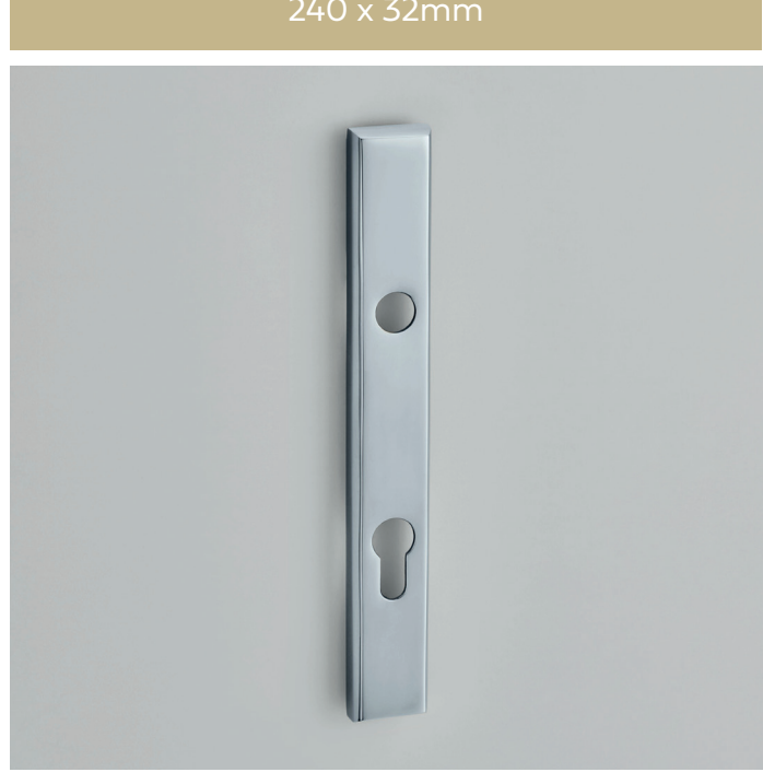
Unsprung or with Spring Cassette Bolt fix or Face fix Choose either 122mm or 215mm fixing centre Available in Latch and Euro Profile