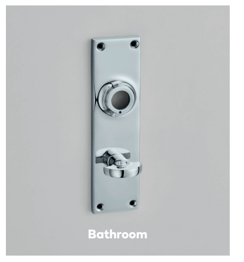
Classic Backplate Latch only