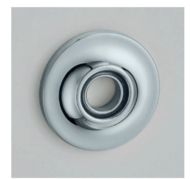
COV57A/65A Plain Covered Rose

• 57mm | 65mm 65mm version available sprung