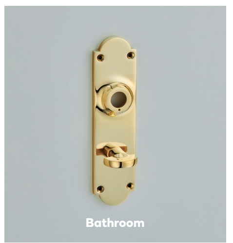
Arched Backplate Latch only