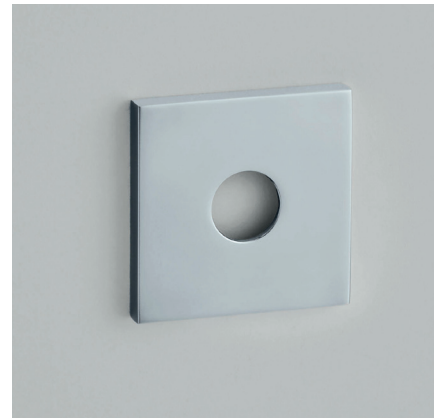
Concealed fix or Face fix available Unsprung only